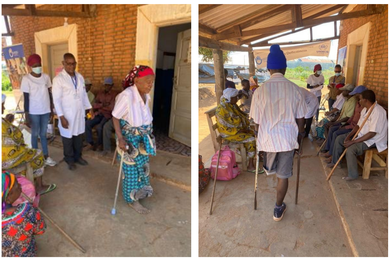
Delivery of assistive devices in Namialo. Nampula Province