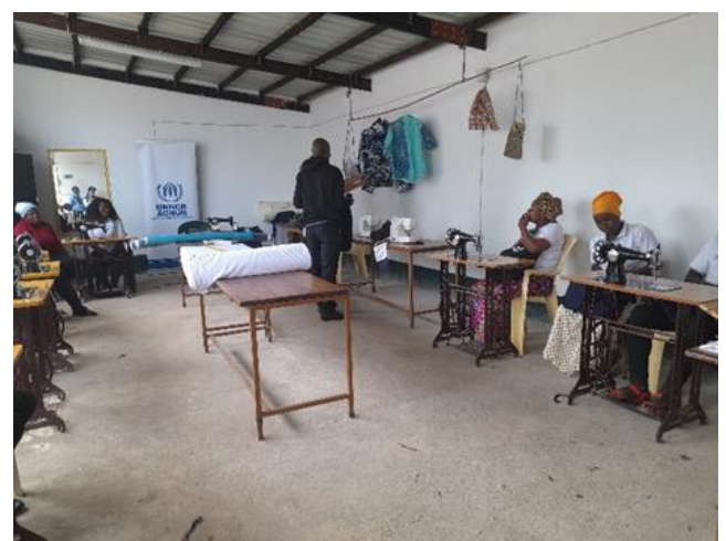
Tailoring in IFPELAC Maratane training center.