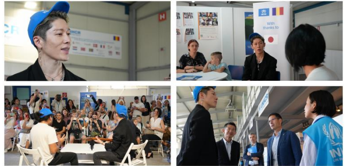
UNHCR's Goodwill Ambassador MIYAVI visiting RomExpo, Bucharest on 22 September 2023.