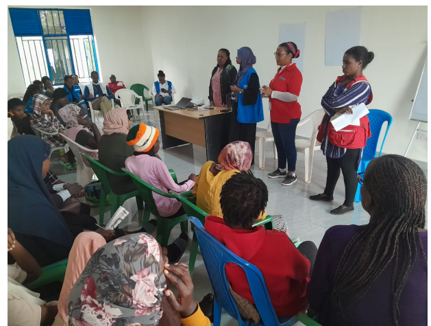
Celebration of the International Day of the Girl Child in ETM on 11 October 2023.