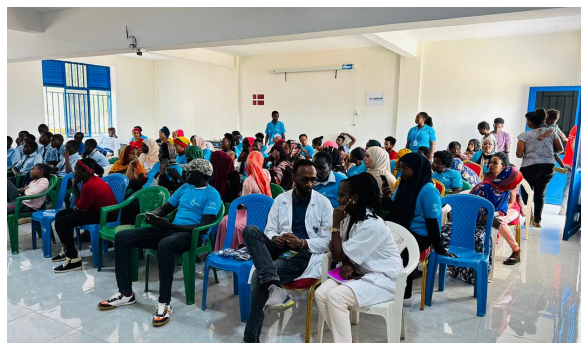
Refugees, host community representatives and humanitarian workers come together to celebrate World Mental Health Day in ETM Gashora.

International Organization for Migration (IOM) is a UN Agency working in the field of migration. UNHCR cooperates with them around refugee resettlement.