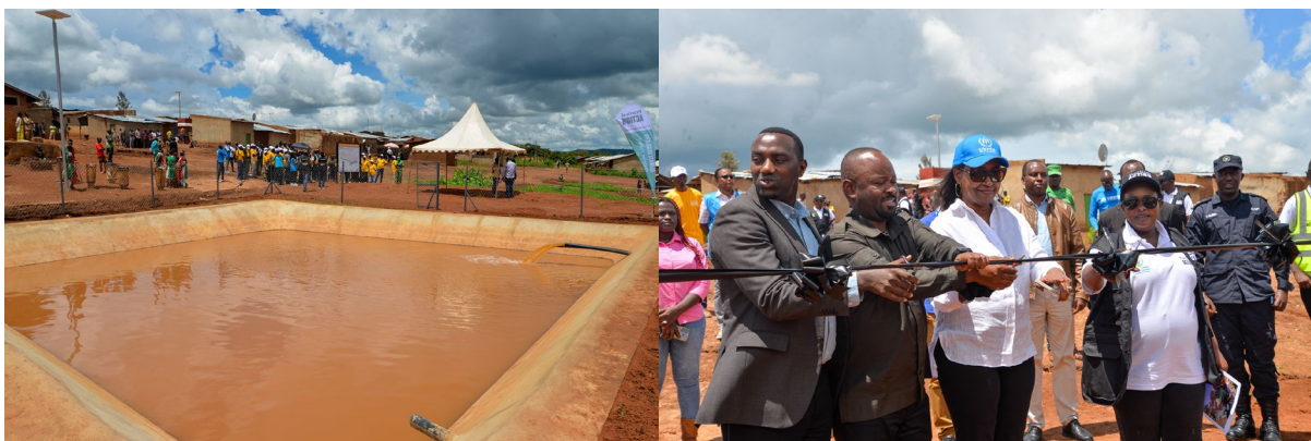
MINEMA, UNHCR and Practical Action inaugurated a new solar-powered water irrigation system in Mahama refugee camp on November 16.

UNHCR STAFF BASED IN KIREHE SUB-OFFICE COVER THE NEEDS OF REFUGEES IN MAHAMA REFUGEE CAMP