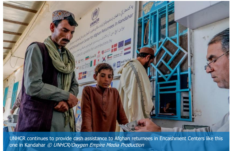
UNHCR continues to provide cash assistance to Afghan returnees in Encashment Centers like this one in Kandahar