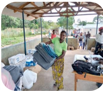
Refugee Receiving Core Relief Items