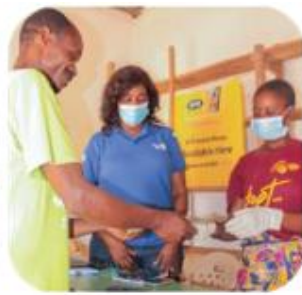
Refugee Receiving Cash Through WFP CBT