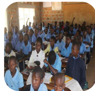
Session in learning