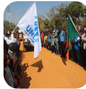
Launch of the 2 nd Phase of VolRep