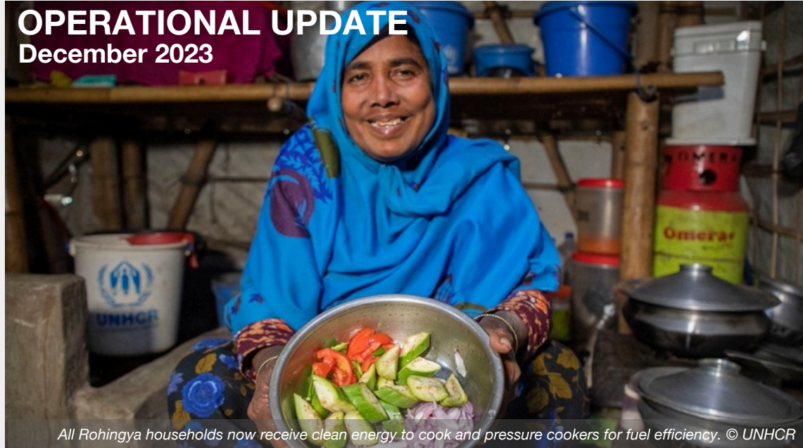
All Rohingya households now receive clean energy to cook and pressure cookers for fuel efficiency.