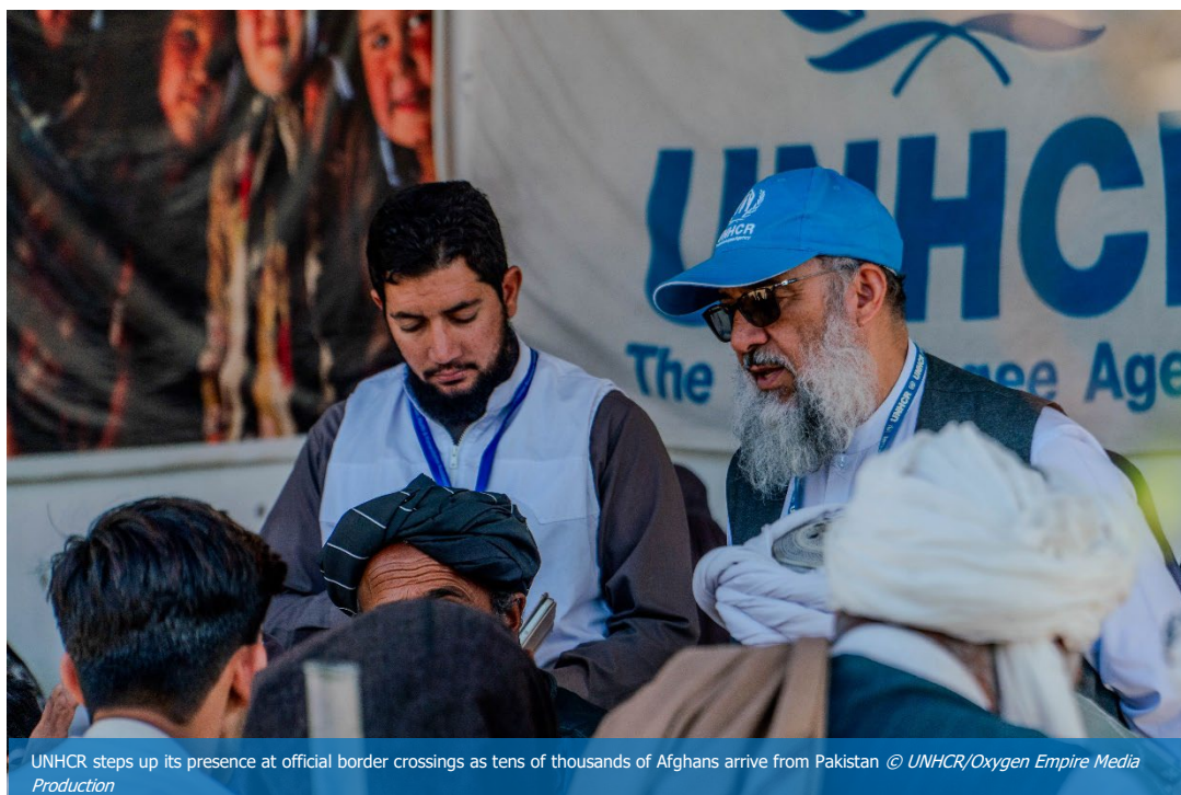
UNHCR steps up its presence at official border crossings as tens of thousands of Afghans arrive from Pakistan