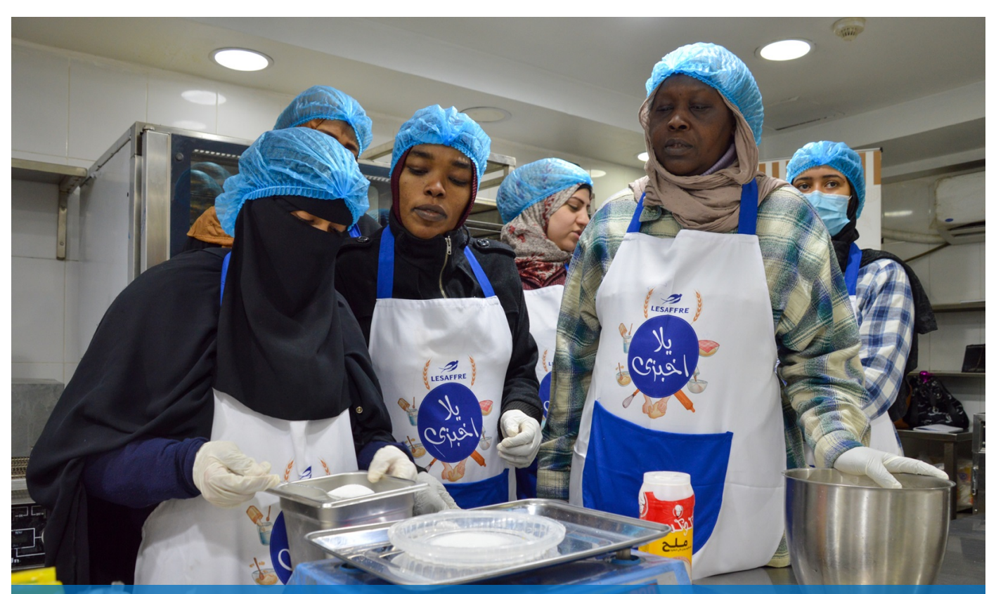
In February, 15 refugee women, including Sudanese, participated in a baking training in a community kitchen in Cairo. The event, organized by UNHCR and the National Council for Women, aimed to enhance refugees' skills for starting and expanding their businesses.

On 28 February, UNHCR and partners conducted the first community engagement session of the year, ahead of the Faisal Safe Space in Greater Cairo. Faisal is a part of Greater Cairo with a sizeable Sudanese refugee population. The session was attended by 32 Sudanese women, all of them new arrivals. The engagement sessions are an initiative undertaken by the Gender-Based Violence (GBV) Sub-Working Group (SWG) co-chaired by UNFPA and UNHCR. As part of this session, UNHCR's partner, the Egyptian Foundation for Refugee Rights (EFRR), provided an overview of different legal procedures, including for different types of documentation, including police reports, birth registration, marriage certificate issuance, divorce, custody procedures and what to do in case of arrest for lack of documentation, residency, and whether registration appointments provide legal protection against arrest or detention. The awareness session was followed by a legal clinic which provided consultation sessions for 38 individual cases.