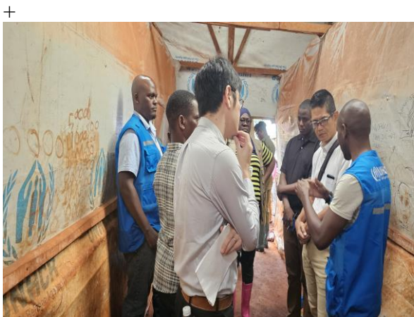
A delegation from the Japan International Cooperation Agency (JICA) visited for the first time Nyarugusu Camp.