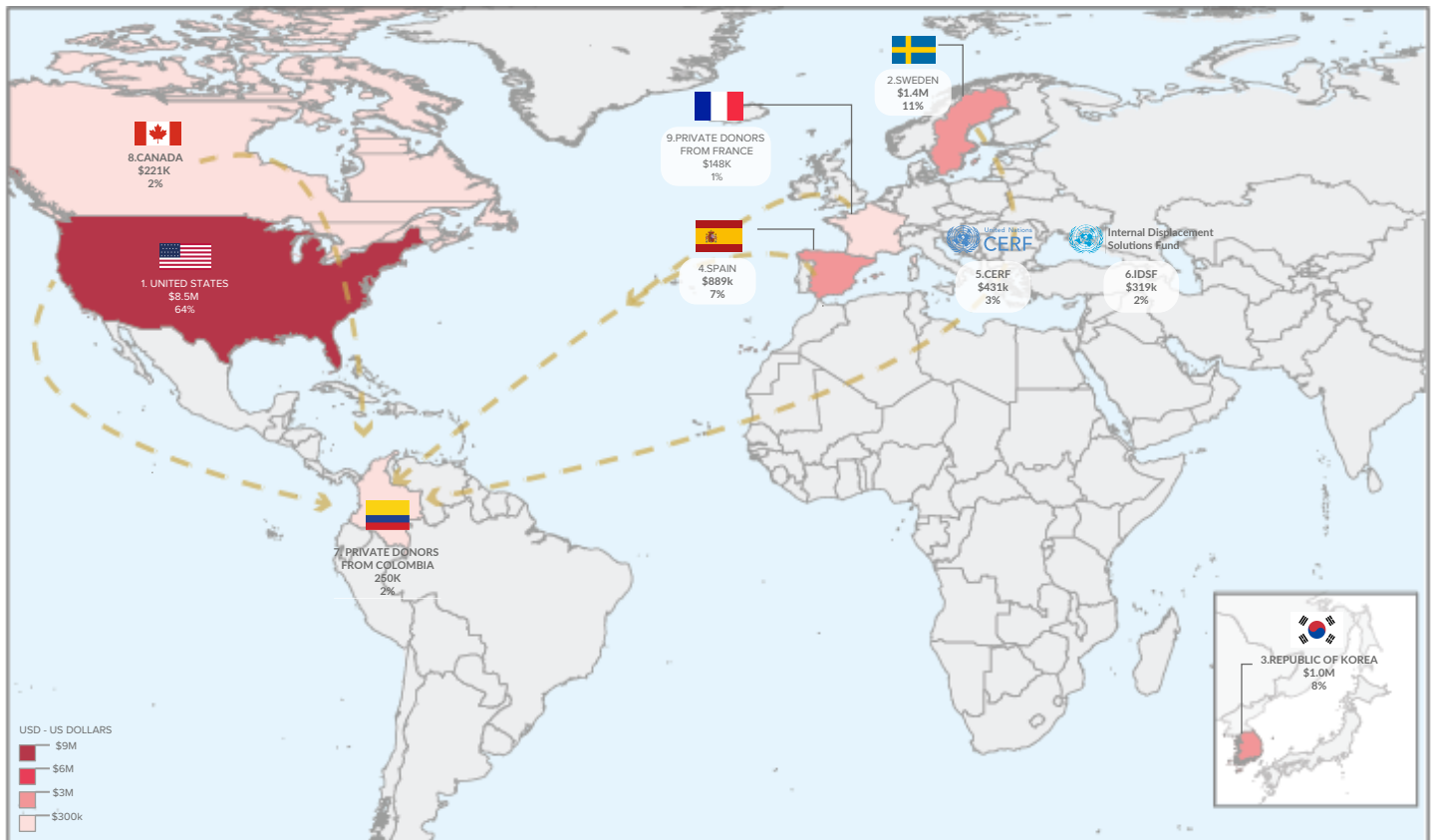
Map 3: Top donors of UNHCR in Colombia in 2024 (cut-off date March 31st, 2024)

3) In Colombia, UNHCR's largest donor is the United States, followed by Sweden, the Republic of Korea, Spain, the Central Emergency Response Fund (CERF), the Internal Displacement Solutions Fund (IDSF), private donors from Colombia, Canada, and private donors from France.