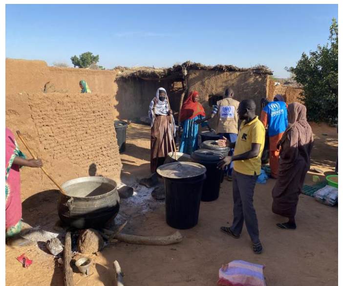
« Preparation of hot meals for relocated refugees in Touloum Refugee Camp »