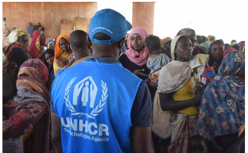
New arrivals at the Adré border on 9 March 2024»