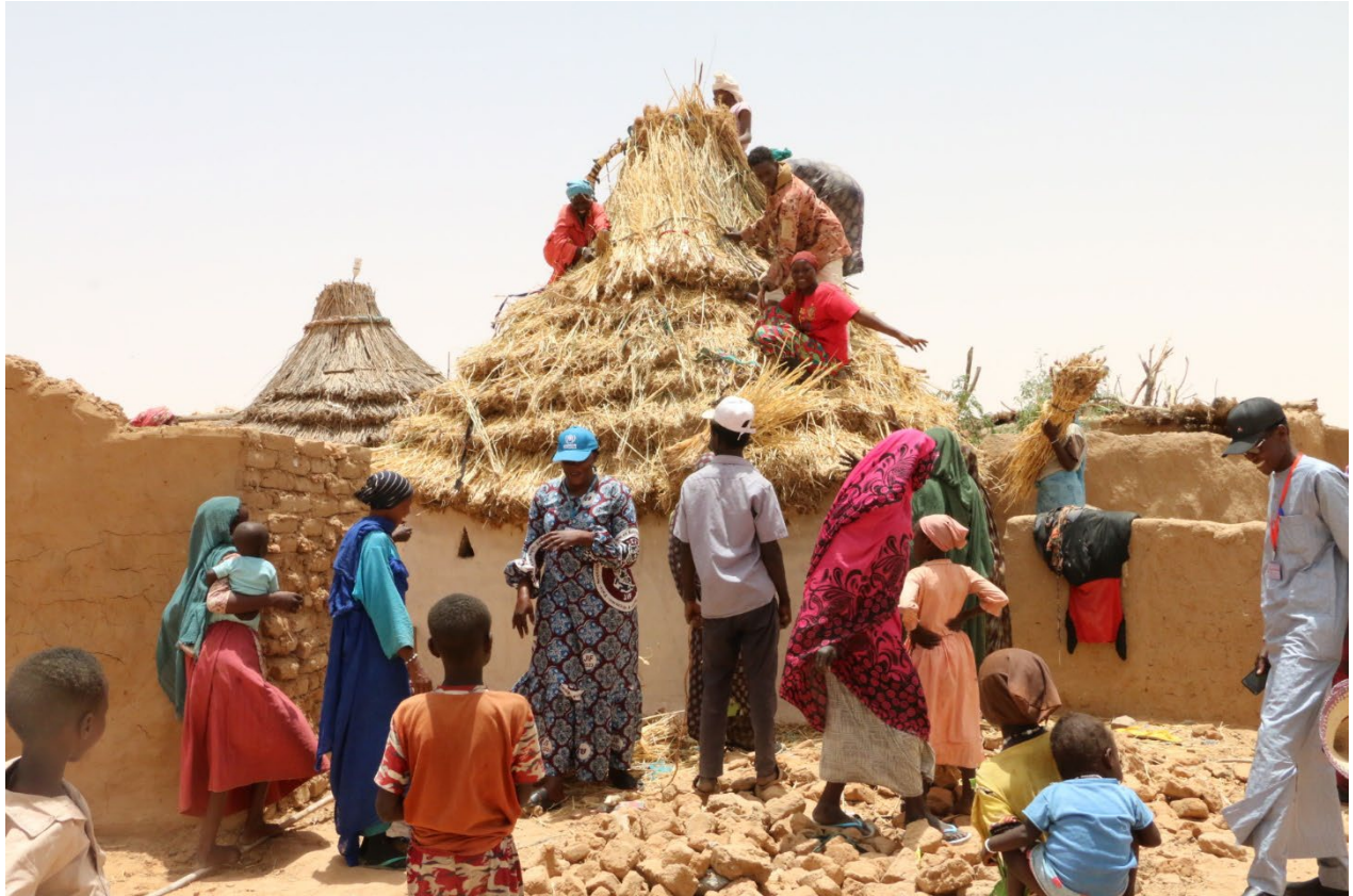
Refugee women in Oure Cassini refugee settlement transforming their emergency shelter into a durable one using local materials