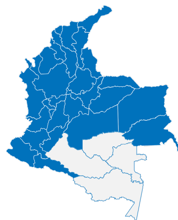
Map 1. CBI delivery areas. 2023.

In 2023, assistance was delivered in 27 departments and 243 municipalities in Colombia. The departments where assistance was most delivered were Antioquia, Norte de Santander, Cundinamarca, Arauca and La Guajira.