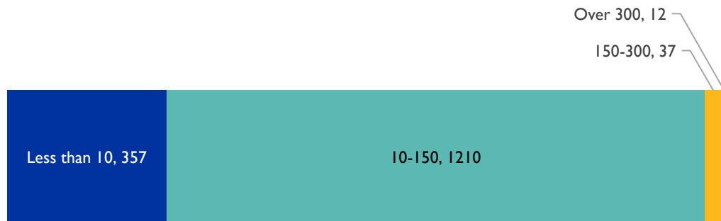
Overall number of CC according to their capacity