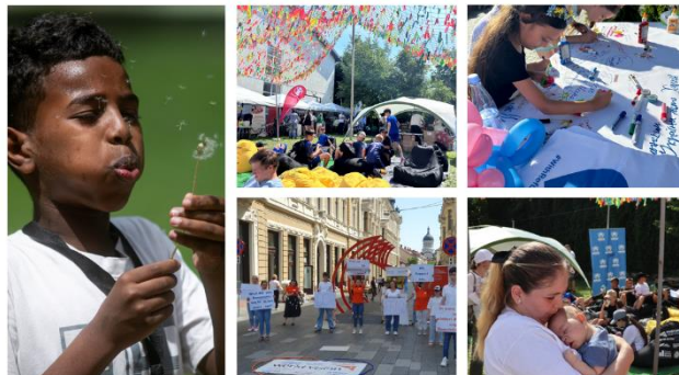
Events to mark the World Refugee Day - 20 June.

Last week, UNHCR and partners marked the World Refugee Day (20 June) in Bucharest, Cluj, Brasov, Galati, Constanta, Iasi, Maramures, Sibiu, Suceava, Targu Mures and Timisoara through a series of cultural events, workshops, games and sports activities, street-art (mural), and photography and digital illustration exhibitions.