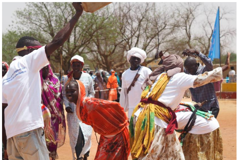
Sudanese refugees displaying their culture during World Refugee Day in Adré