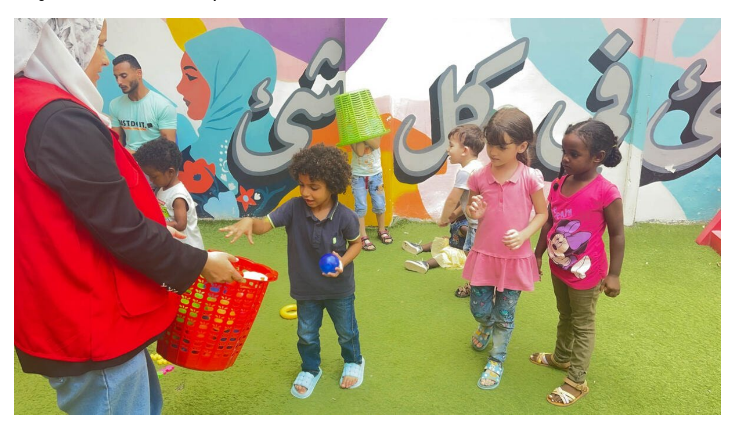
Refugee and host community children share this playground, and have joint activities, and sports at this community centre run by Caritas in Alexandria, Egypt. Egyptians, Sudanese, Syrians, and other refugee families share this common space that allows for social cohesion within society.

ICRC also finalized documentation for family tracing for 249 children in Sila province. 4,572 newborns were registered at birth, as part of statelessness prevention. Community-based child protection structures were strengthened with the work of at least 531 community volunteers who are using the service mapping and child protection referral pathways. Eight child-friendly spaces were built in Ouaddaï and Wadi Fira provinces by Plan International, World Vision and Croix Rouge du Tchad between January and March.