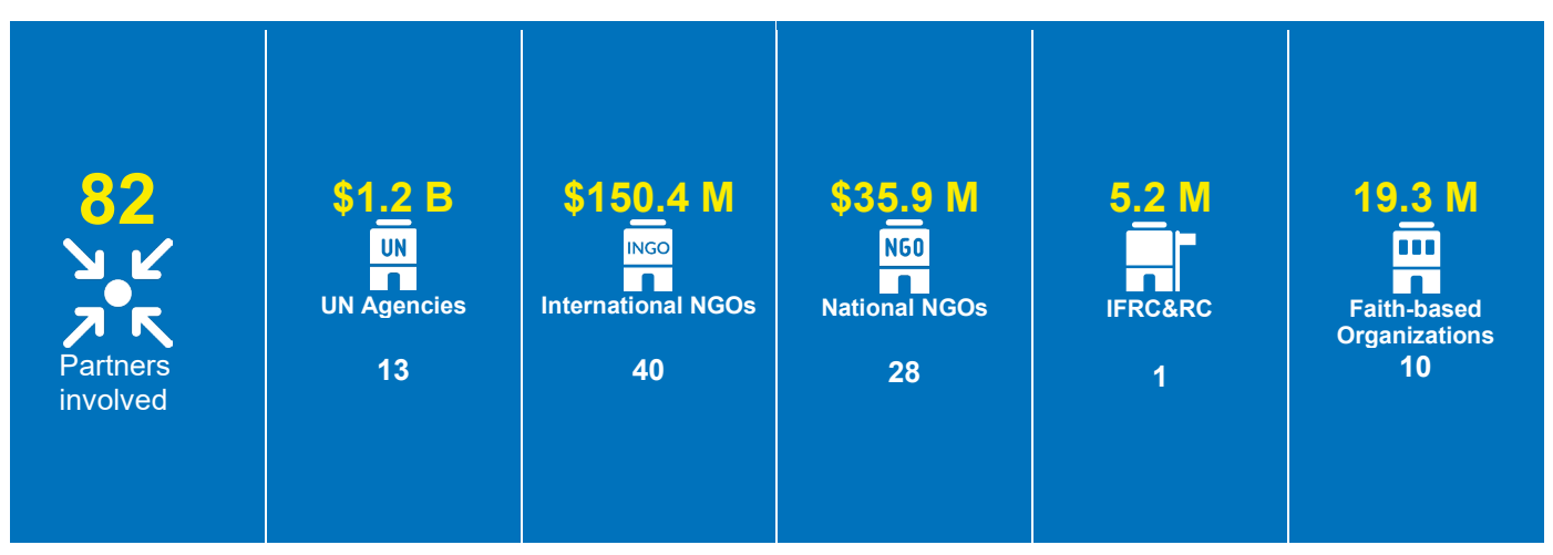
Notes: This list only includes appealing organizations under the RRP, many of which collaborate with implementing partners to carry out RRP activities.

Humanitarian, development and peacebuilding actors worked together to strengthen to secure predictable, multi-year development financing in support of the regional Sudan crisis. For example, in Chad and South Sudan, the African Development Bank has activated its crisis financing windows to scale up engagement more rapidly. Also, in Chad, progress was made to engage the World Bank to support the government on its prevention and resilience agenda for the new crisis in Eastern Chad, in a number of strategic areas. EU-INTPA has also provided early development support to Chad, Ethiopia and South Sudan to support solutions from the onset of the emergency, with a focus on investing in integrated settlements, extending and expanding service delivery and creating economic opportunities in areas impacted by the crisis.