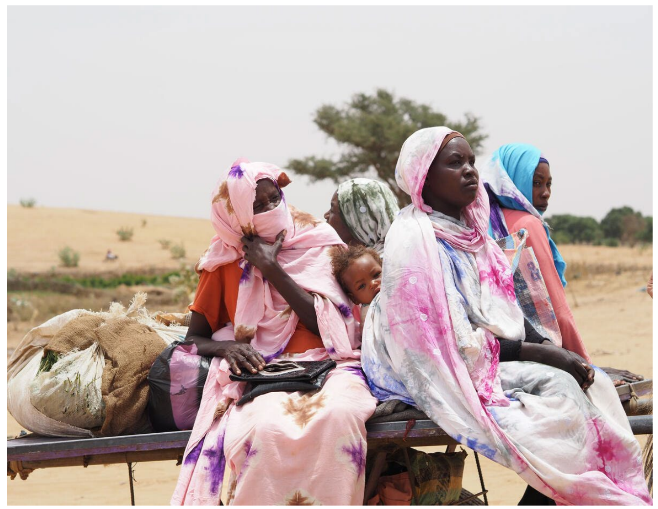
As of April 2024, over 570,000 Sudanese refugees have arrived in Chad since the Sudan conflict started one year ago, nearly as many as Sudanese refugees as Chad has received in the past two decades. Women and children represent some 90 per cent of the refugees, with 77 per cent of women arrived alone in Chad, with children

has requested support from all stakeholders to develop a national response strategy in Eastern Chad to respond to the influx of Sudanese refugees. RRP partners and the local authorities carried out a joint assessment during which they met community leaders to prepare for the re-opening the sixth refugee site in Chad.