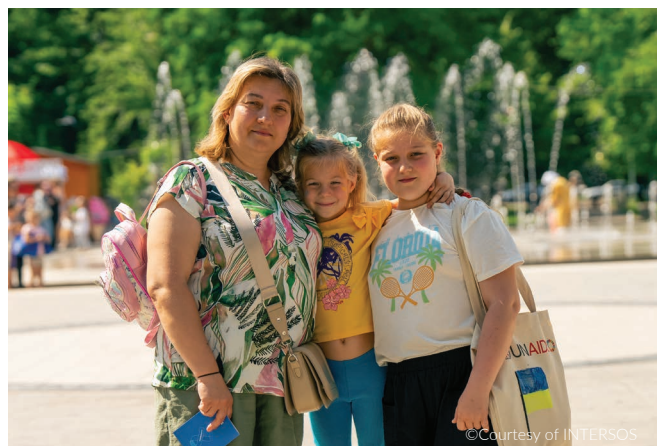
A Ukrainian family in a moment of solace at the "Day in the Park" activity in Alunelul Park, Chişinău. Held on June 16, this event offered recreational activities provided by refugees and the Moldova Refugee Coordination Forum partners for the community as part of World Refugee Day commemoration.

UNHCR signed a Memorandum of Cooperation with the Municipality of Chişinău, focusing on implementing the Cities of Solidarity initiative. This collaboration strengthens local communities, authorities, and civil society organizations in responding to the refugee situation. It opens more opportunities for coordination, and refugee inclusion. Chişinău, the capital of the Republic of Moldova, hosts more than 18,000 refugees from Ukraine underscoring the city's critical role in the refugee response. UNHCR has already established similar agreements with other key cities, such as Ungheni, which borders Romania, and Otaci, a major border city with Ukraine, thereby creating a network of solidarity and support for refugees and vulnerable population across the country.