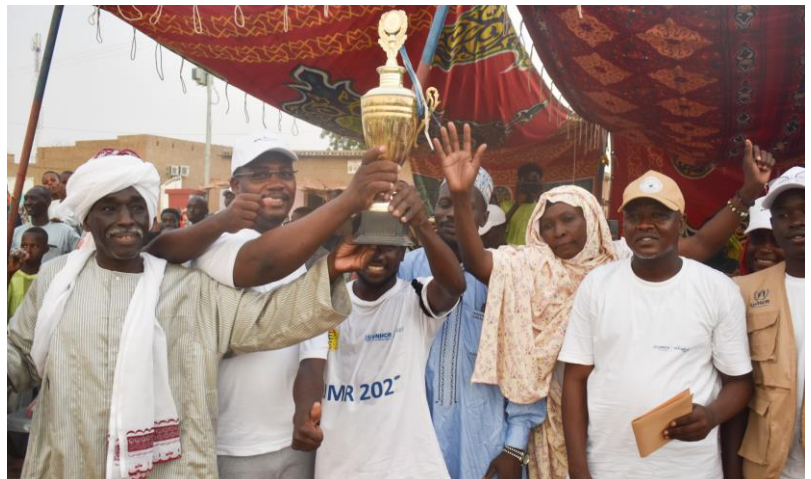
Refugees won World Refugee Day football match against the Chadians