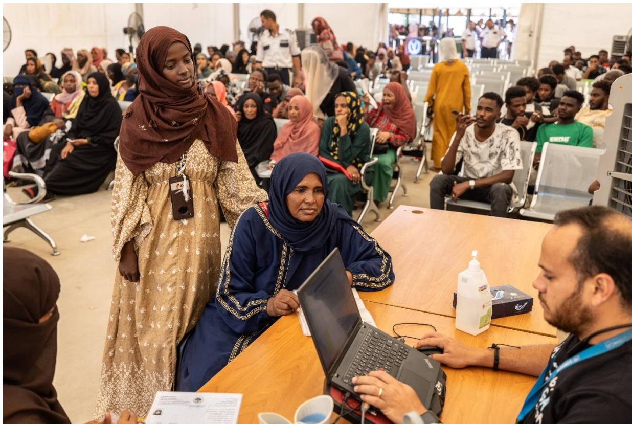
UNHCR in Egypt continues to register refugees and asylum-seekers to facilitate their access to international protection and essential services.