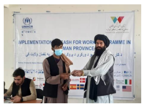
A beneficiary of Cash for Work assistance receiving cash