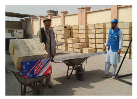
A beneficiary of solar package receiving his solar assistance in Laghman