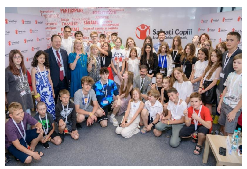
Refugee children from Ukraine meet with decision makers at Save the Children's Counselling and Integrated Services Centre in Bucharest.

This summer, Save the Children hosted the "Young Voices of Ukraine - Children's Participation Forum" a consultation event dedicated to refugee children from Ukraine. Over 270 children, aged 9 to 17, participated in consultations events across Bucharest, Baia Mare, Constanța, Galați, Iași, Năvodari, Suceava, Timișoara, and Tulcea. They discussed were informed about their rights, including the right to participate, identified main problems related to their education and