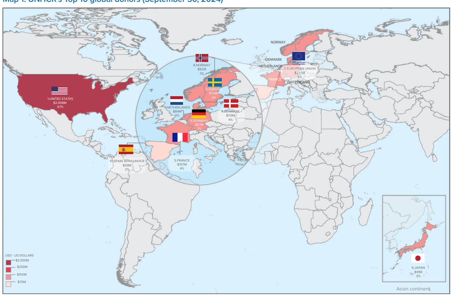
Map 1: UNHCR's Top 10 global donors (September 30, 2024)

1) Globally, UNHCR's largest donor is the United States, followed by the European Union, Sweden, Dennmark, France, Japan, Germany, the Netherlands, Norway and Spain for UNHCR, all of which are among the top 10 donors.