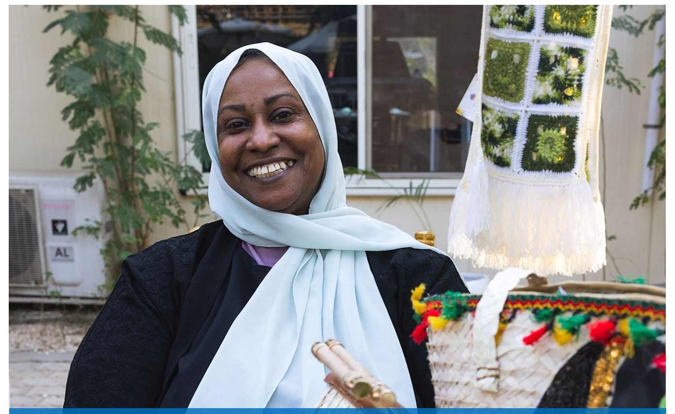
A Sudanese refugee showcases her handcrafted products at a livelihoods fair hosted by UNHCR in Cairo on 19 December 2024.

In the second half of December 2024, UNHCR supported Sudanese refugees in showcasing and selling their products at various livelihoods events. From 12 to 21 December, UNHCR participated in the "TURATHNA Exhibition for Handicrafts and Heritage" in Cairo, which featured items created by 21 refugees and asylum-seekers. These were presented in collaboration with three local social enterprises—Yadawee, Threads of Hope, and Samar Hakeem—operating under the MADE51 initiative. On 19 December, UNHCR and its partners organized a refugee celebration event in Cairo to promote social cohesion. The event showcased the exceptional talents and creativity of refugees through music, art, and craftsmanship, along with displays of handmade goods and other products. These initiatives highlighted the resilience of refugees and their valuable contributions to the community.