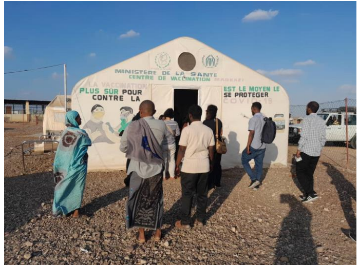
Korean and Ethiopian doctors conducted medical outreach in the village of Markazi

On 6 January, a team composed of Korean and Ethiopian doctors started offering medical services to refugees in Markazi village. This medical outreach that lasted three provided to refugees four specialized medical services including dental, gynecology ophthalmology, and visceral surgery. The outreach was organized by ONARS.