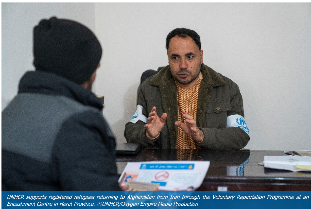
UNHCR supports registered refugees returning to Afghanistan from Iran through the Voluntary Repatriation Programme at an Encashment Centre in Herat Province.