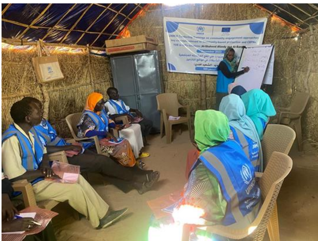
Training for CBPN facilitated by UNHCR at Elshahid-Afandi MPCC in Blue Nile State