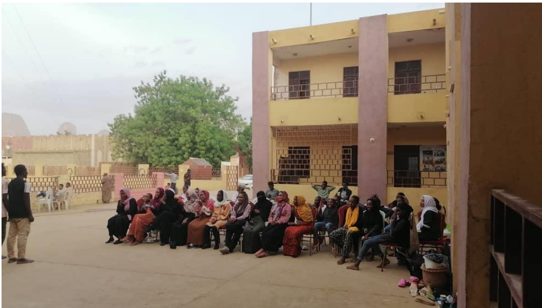
IDP and host community youth at the MPCC in Kassala for recreational activities

Recreational Activities: The centres also offer spaces for recreational, cultural, and sports activities that help promote social cohesion among the different population groups and enhance the mental well-being of the community. These activities are determined in collaboration with the community.