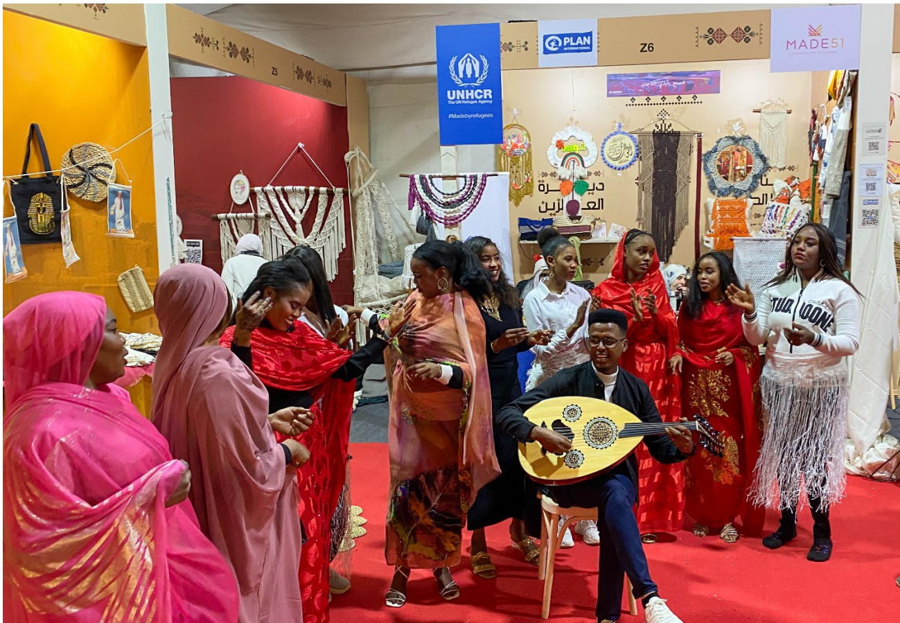
On 27 February, a group of Sudanese refugees carried out a musical performance in the 67th edition of the Diarna Exhibition for Handicrafts in Cairo.

During the reporting period, 740 individuals received legal assistance and counselling through UNHCR and partners, concerning early and late birth registration, filing legal reports, divorce, custody, and legal representation. Additionally, UNHCR provided LPP case management for 170 refugees