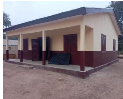
The health centre built by UNHCR in Betoko. @HCR

In education, 101 table-benches have been handed over to the two mixed schools, 1 and 2, in Betoko. Regarding support for health infrastructures, UNHCR has built an observation room with 12 beds at the Betoko health centre. Regarding hygiene, UNHCR has distributed 12,000 bars of soap to 909 Chadian refugee households in Betoko.