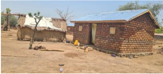
House built as part of the support for the return IDPs in Bria. @HCR

This assistance has benefited 35 households of internally displaced people. Since 2016, these efforts have aimed to reduce the vulnerability of IDPs living on these sites while preserving their dignity.