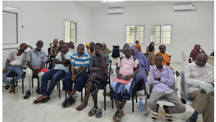
UNHCR and its partners raise awareness among refugees and asylum seekers following the Djibouti Interior Minister's declaration of the new political strategy

UN Agencies in Djibouti discussed impact of funding cuts on health. On 13 April all UN agencies operating in Djibouti met to discuss the way forward as impact of funding cuts is getting severe on the health of vulnerable communities. Agencies such as UNICEF and the WFP, which in Djibouti are involved in refugee health, nutrition and immunization, have announced that the reduction in their budgets will have serious consequences for the vulnerable host and refugee population. UN agencies are closely monitoring the situation and working in collaboration with the ministry to avoid such scenario. All agencies agreed to work together in finding other possible solutions.