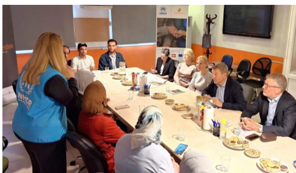
Ambassadors of Denmark, Sweden, Norway, and Finland in a focus group discussion with Syrian refugees under temporary protection in Hatay.