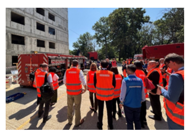
to respond to large-scale emergencies and reflects a strong commitment to protecting both displaced and host communities.

From 21–25 June, Basic Needs sector partners took part in Romania's national disaster simulation exercise "SEISM 2025," coordinated by the Department for Emergency Situations (DSU). The exercise simulated the impact of a combined earthquake and nuclear incident, testing emergency response systems across multiple sectors. Participating actors included line ministries, the Romanian Red Cross, DGASMB, Save the Children, Habitat for Humanity, IOM, WHO, and UNHCR. Basic Needs actors ensured essential services were delivered at simulated transit sites. In a significant contribution to national readiness, UNHCR completed the transfer of an emergency stock of relief items with a value of US$ 6.65 million to DSU at the end of June. The stock, including generators, tents, and blankets, bolsters Romania's ability