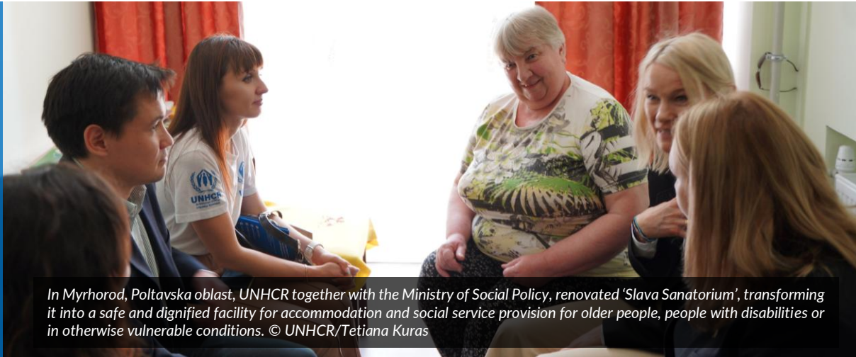
In Myrhorod, Poltavska oblast, UNHCR together with the Ministry of Social Policy, renovated 'Slava Sanatorium', transforming it into a safe and dignified facility for accommodation and social service provision for older people, people with disabilities or in otherwise vulnerable conditions.