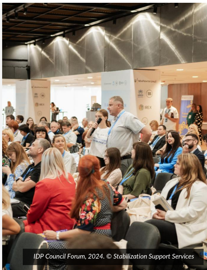
IDP Council Forum, 2024.

Working closely with governmental and parliamentary stakeholders, UNHCR and partners' advocacy actively contributes to important change and progress, such as the creation of the Congress of IDP Councils , further strengthening this critical participatory instrument of IDPs; the introduction of a financing model for social services for older IDPs based on the principle of 'money follows people' based on Resolution 888; and several legislative acts that facilitate IDPs' access to compensation and housing solutions, such as Law 4080-IX on IDP housing or Law 4114-IX granting IDPs priority in receiving compensation for war-affected houses. A key advocacy effort has been centred on ensuring adequate state budget allocations for IDPs' access to compensation for housing damage, culminating in the adoption of Resolution No. 1432, which allocated UAH 15 billion. This is expected to benefit approximately 10,000 households that have lost their homes due to the war.