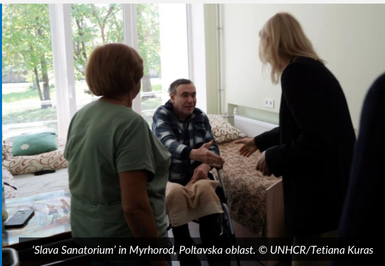
'Slava Sanatorium' in Myrhorod, Poltavaska oblast.

In Myrhorod, Poltavaska oblast, UNHCR together with the Ministry of Social Policy, renovated 'Slava Sanatorium', transforming it into a safe and dignified facility for accommodation and social service provision for older people, people with disabilities or in otherwise vulnerable conditions, displaced by the ongoing war in Ukraine. Beyond the physical rehabilitation of the centre, Slava Sanatorium is also part of a progressive pilot programme. In close cooperation with the Ministry of Social Policy, UNHCR and NGO partner Right to Protection are working to strengthen the capacity of social workers in the Sanatorium and community to facilitate social adaptation, which will enable IDPs who are currently residing in the sanatorium to live independently in the community. Read more here .