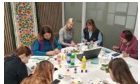
On 19 November, Ukrainian refugee women attended a Women’s Club session at UNHCR’s Community Centre.

Over the past week, UNHCR hosted a series of community activities in Bucharest to foster creativity, inclusion, and cross-cultural understanding. On 18 November, children aged 6–11 from Hub Băneasa practised Romanian through shopping-themed role-play, boosting confidence and social skills, while older participants attended a session on recognising online scams and safe internet use, which was warmly received. On 19 November, UNHCR and WHO ran a Women’s Club session, Discover Yourself, where participants explored relationships, conflict-prevention techniques.