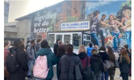
On 17 November, students from the Business and Administration Faculty of the University of Bucharest visited UNHCR’s Community Centre at RomExpo in Bucharest.

On 19 November, UNHCR published its Global Appeal 2026 . The Global Appeal highlights UNHCR’s plans for the coming year and the funding needed to protect, assist and empower a record number of forcibly displaced and stateless people, and help them find solutions. As the international armed conflict in Ukraine approaches its fifth year, the humanitarian situation will remain critical in the coming year. To help meet the needs of forcibly displaced persons from Ukraine, UNHCR is seeking US$ 470 million for the Ukraine situation including US$ 23.4 million for Romania.