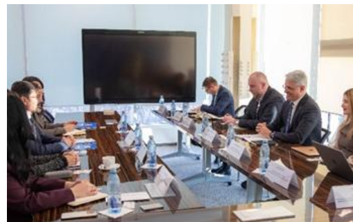
On 19 January, the UNHCR Representative met with Romania's Minister of Investments and European Funds, Dragoș Pîslaru, and senior officials to discuss refugee support and future cooperation.

On 19 January, UNHCR Representative Pablo Zapata met with Romania's Minister of Investments and European Funds (MIPE), Dragoș Pîslaru, and senior officials to discuss refugee support and future cooperation. UNHCR presented its work in Romania and highlighted areas where refugee needs could be better addressed. The Minister shared MIPE's priorities for the 2021-2027 period and upcoming financial programmes. Both parties emphasised the importance of continued collaboration to strengthen support for vulnerable populations, including refugees and the Romanian communities that host them, and agreed to further explore joint initiatives under the European Social Fund+ programme.