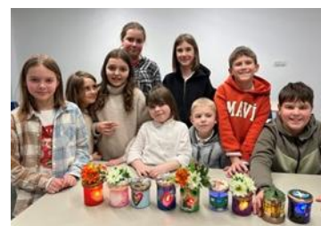
On 21 January, children took part in creative and recreational activities at UNHCR's Community Centre at RomExpo.

On 21 January, UNHCR hosted a creative workshop for children aged 6–12, where participants brought jar lanterns to life through their imagination. The session went beyond a simple craft activity, providing a safe and child-friendly space for sharing ideas, experimenting with colours, and collaborating with peers. The room buzzed with energy and creativity as children painted imaginative designs, crafted unique patterns, shapes, and characters, and made gifts for their friends. The workshop nurtured creativity, teamwork, and confidence, leaving participants proud of their achievements and inspired to continue expressing themselves through art.