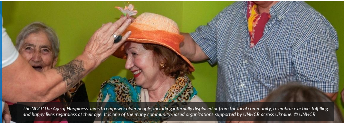
The NGO 'The Age of Happiness' aims to empower older people, including internally displaced or from the local community, to embrace active, fulfilling and happy lives regardless of their age. It is one of the many community-based organizations supported by UNHCR across Ukraine.