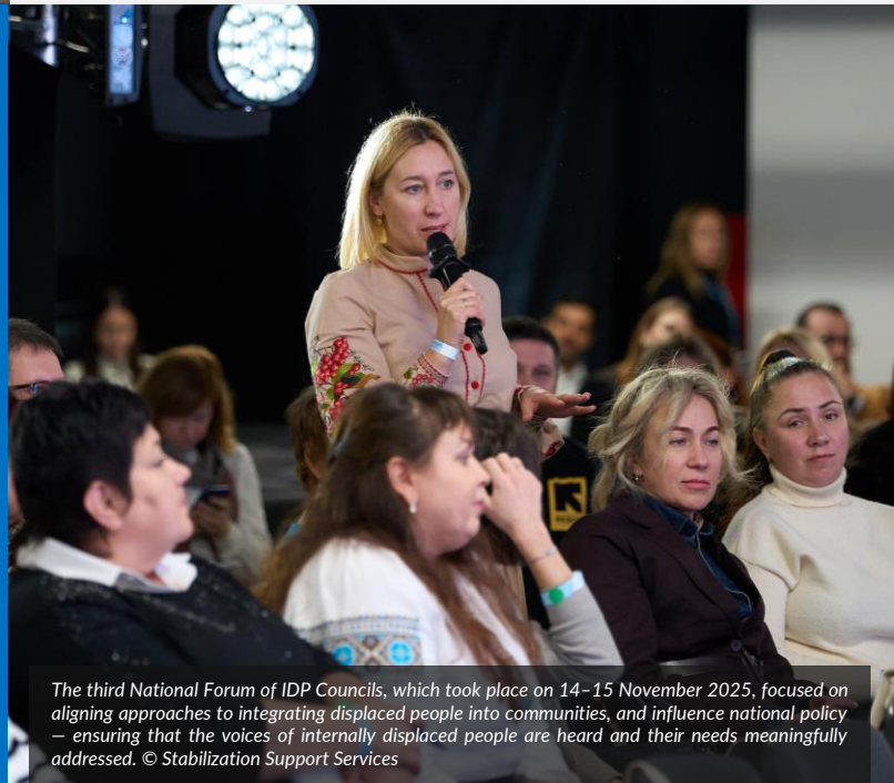
The third National Forum of IDP Councils, which took place on 14–15 November 2025, focused on aligning approaches to integrating displaced people into communities, and influence national policy – ensuring that the voices of internally displaced people are heard and their needs meaningfully addressed.

WORKING WITH IDP COUNCILS: Across Ukraine, more than 800 councils of internally displaced people (IDPs) are working within local authorities to ensure that those who fled the war can take an active part in community life and decision-making. True to the vital concept of 'people protecting people', and supported by UNHCR and its partner Stabilization Support Services (SSS), the councils provide a platform for dialogue between displaced people, communities and local authorities. They help shape solutions on housing, livelihoods, education, and social protection. They play a pivotal role in amplifying the voices of displaced people in local planning and ensuring that recovery and integration efforts reflect their real needs and lived experiences. UNHCR and SSS have so far supported the establishment of and provided capacity development for over 100 IDP councils across Ukraine. Through continuous capacity-sharing initiatives including on leadership, advocacy, community engagement, and project management, UNHCR and its partners help councils enhance their effectiveness and sustainability. Read more here .