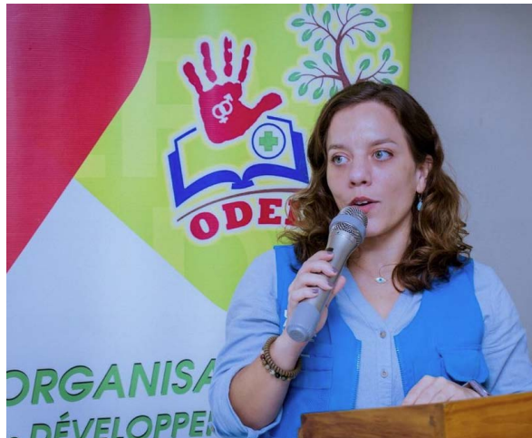
UNHCR works with partner ODELPA, a women-led Haitian NGO, to protect vulnerable women and girls through training, awareness campaigns, and economic empowerment, helping strengthen protection and resilience in areas affected by violence.