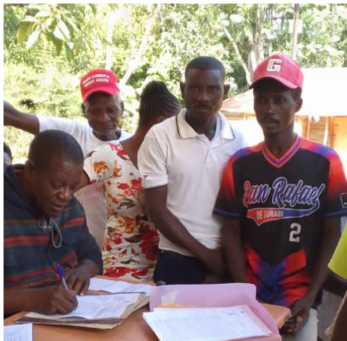
Through a mobile campaign in Capotille, more than 100 people were registered and received their birth certificates the same day, an important step toward preventing statelessness in Haiti.