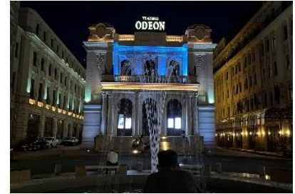
The Odeon theatre in Bucharest on 20 June - one of several buildings illuminated in blue to mark World Refugee Day.

During the past week, refugees, UNHCR and partners, marked the World Refugee Day (20 June) with a series of events on the theme “Until Everyone is Safe”. Coming at a time when the right to seek asylum is under growing pressure in many parts of the world, it reminds people of the enduring relevance of the 1951 Refugee Convention . Adopted 75 years ago, the Convention is based on a simple but powerful, universal principle: the right to seek safety extends to us all.