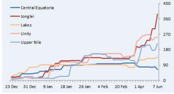
Internal displacement by state as of 7June (in thousands).

Access constraints and insecurity remained a concern to the aid operation. A truck carrying humanitarian supplies from Bentiu to Rubkona in Unity State hit a land mine on 6 June. Partners also reported that armed elements attempted to commandeer a humanitarian cargo plane on Rubkona airstrip. In another incident, a truck carrying aid supplies was looted in Wau town, Western Bahr el Ghazal State.