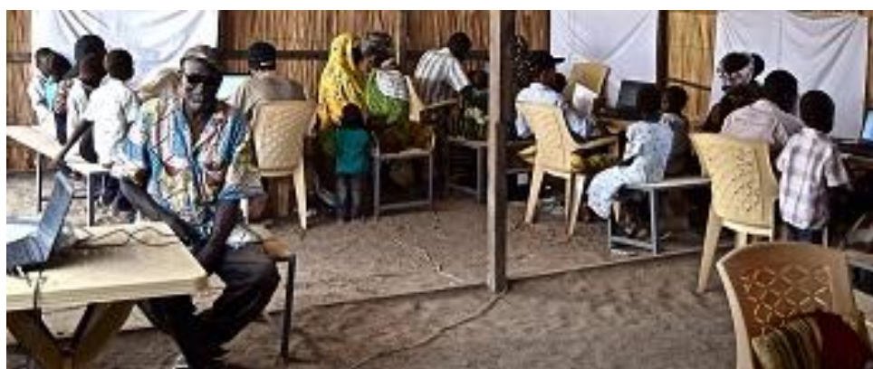
Registration exercise in Al Kashafa, White Nile State