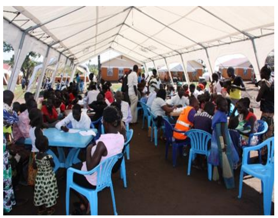
Physical verification exercise being conducted in one of Adjumani's settlements ©UNHCR/A.Tsujisawa.