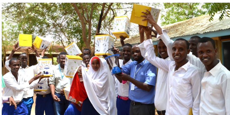
KCSE candidates in Dagahaley Secondary School with their new solar lanterns

secondary school students and elderly now use solar lights.