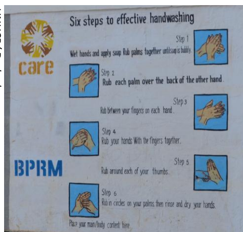
Wall painting at Bahati Primary School, Dagahaley