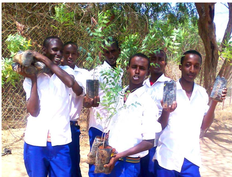
RRDO facilitated tree planting in a school in Dagahaley camp