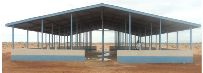
Newly constructed market stall in Ifo 2