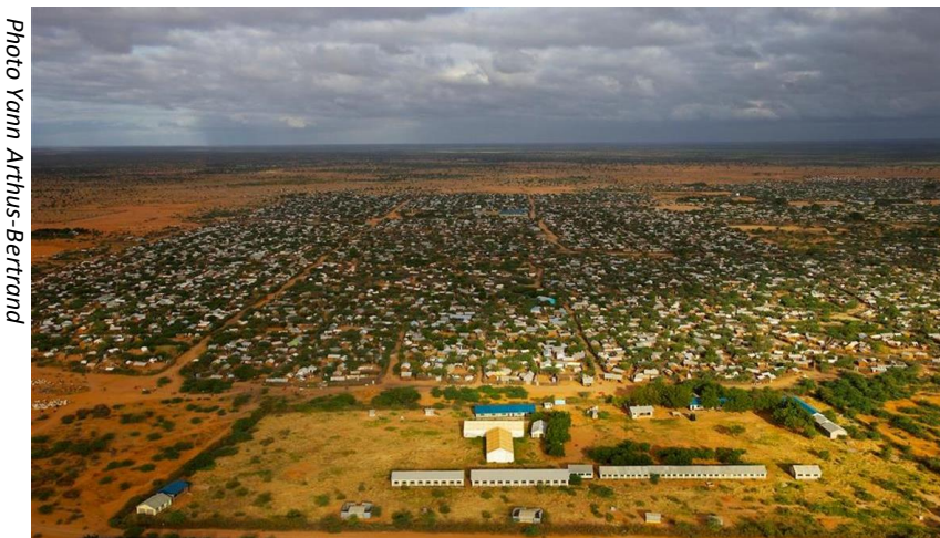
Dagahaley camp from the air