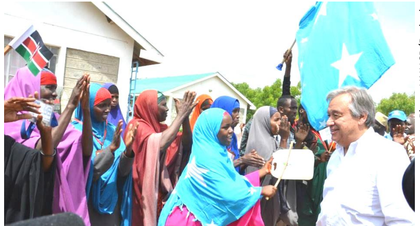
Refugees of Ifo 2 camp welcoming António Guterres

The government of Somalia together with the Regional Governments and UN agencies will prepare a plan of concrete projects for the eight districts. These projects will focus on education, health, shelter and support to agriculture to facilitate the integration of those who choose to go back.