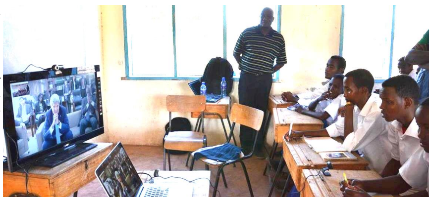
Students in Dagahaley camp talking with John Kerry

In his answer to concerns raised by students about their future in Dadaab once they finish high school, Mr. Kerry said: "We don't want you be in this camp forever, we want people to be able to move from the camp back to their home when there is peace." Mr. Kerry added, "You will need the skills that you got now. It's very valuable to be doing what you are doing. What we need to do is to try to figure out how to provide more education opportunities beyond where you are now."