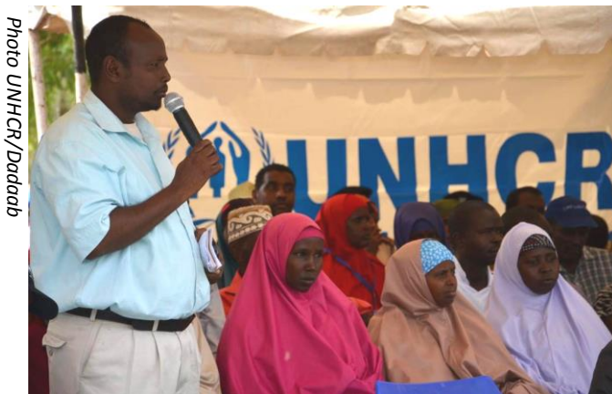
Refugee leaders addressing to the UN High Commissioner for Refugees and his delegation

The President of Jubaland assured the High Commissioner that his government would provide land and other support for the projects and the returnees. As soon as this plan is prepared, the Governments of Somalia and Kenya and UNHCR plan to convene an international conference for support to the implementation of the plan. "What we are trying is to convince the International Community that, in this world, in which there are so many wars and so many problems, Somalia is a country that can be stabilized". Mr. Guterres said.