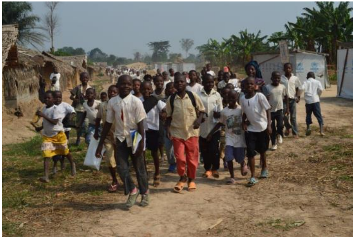
Central African refugee children in 15 avril site, Betou, Republic of Congo.