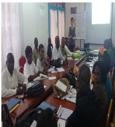
Members of the Ministry of Health trained by CCCM on 21 May 2014.