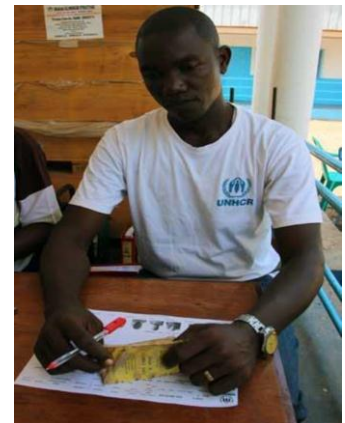
UNHCR employees, members of the National Commission for Refugees and DRC workers are handling the procedure.