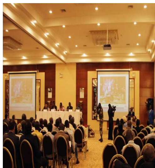
World refugee Day- official ceremony in Bangui- The Representative of refugee community in the CAR, opened the official ceremony event with a minute of silence in memory of the victims of the crisis in the CAR.