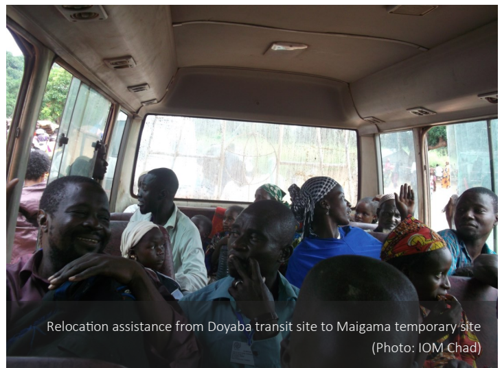
Relocation assistance from Doyaba transit site to Maigama temporary site

As of 3 rd November, a total of 113, 086 returnees, CAR-claiming nationals and TCNs who fled the violence in the CAR have been registered by IOM and partners, of which 60,022 are still residing in temporary and transit sites in Danamadja, Djako, Doyaba, Gaoui, Kobiteye, Maigama, Mbitoye, and Sido, as well as in host villages in the South of the country.