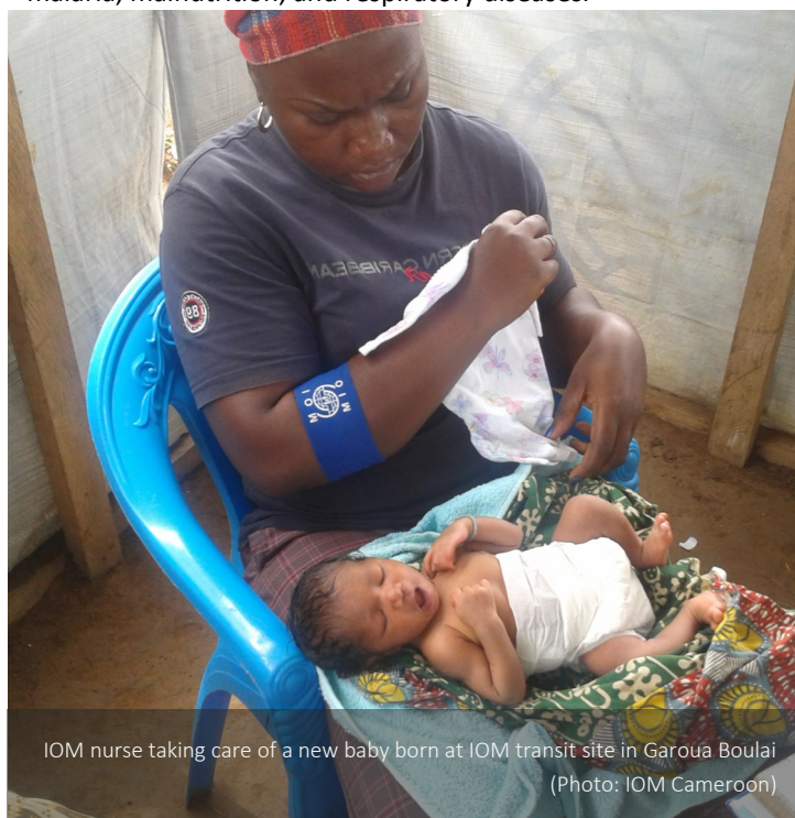
IOM nurse taking care of a new baby born at IOM transit site in Garoua Boulai

During the reporting period, IOM's medical team conducted medical consultations for 48 cases in Kentzou and for 25 cases in Garoua Boulai, of which five cases were referred to MSF. Since May 2014, IOM has provided medical consultations for 1,077 cases in Garoua Boulai, and has referred 101 cases to MSF. Additionally, since June 2014, IOM's medical team in Kentzou has conducted medical consultations for 1,010 cases of which 24 were referred to local hospitals. The majority of cases received by the medical team concern diarrhoea, intestinal parasites, malaria, malnutrition, and respiratory diseases.