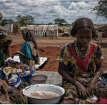
Central African Republic Regional Refugee Response Plan January - December 2015

2015 contributions (USD) as of 14 December 2015